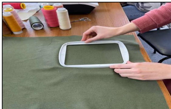
Fig. 3. Securing the fabric in the hoops