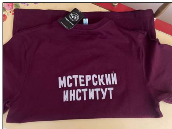
Figs. 5, 6. Work performed by students of the Mstyora institute of lacquer miniature painting named after F.A. Modorov

Currently, at the Mstyora institute of lacquer miniature painting named after F.A. Modorov, students continue to master machine embroidery and work with modern computer software.