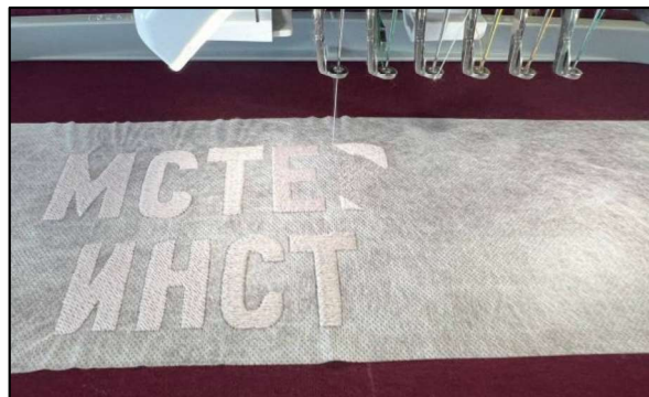
Fig. 4. Embroidery process on a Brother embroidery machine