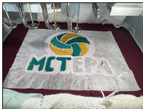
Fig. 2. Embroidery process on a Brother embroidery machine