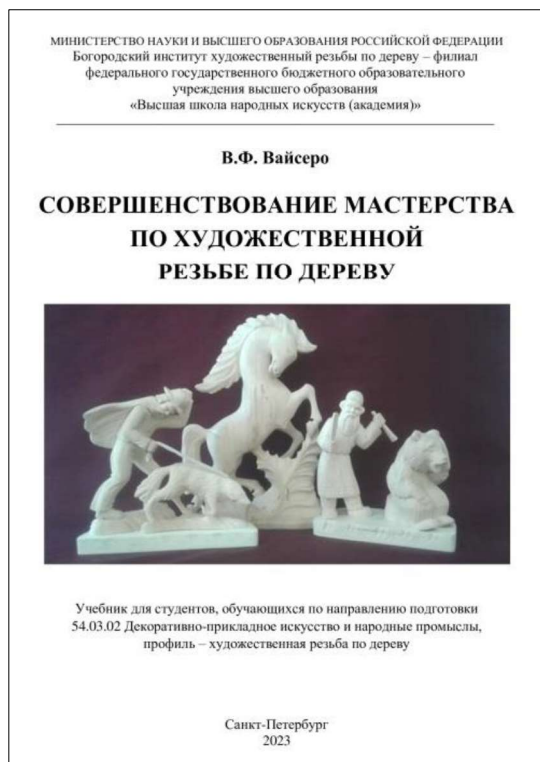
Fig. 5. V.F. Vaisero "Improvement of skill in artistic wood carving"

The next textbook by V.F. Vaisero, "Improvement of skill in artistic wood carving" [4] (Fig. 5 90 ), was also developed for students enrolled in the training program 54.03.02 Decorative and applied arts and folk crafts, profile: artistic wood carving. It is intended for third-year students as well as wood carvers with basic skills in artistic wood carving.