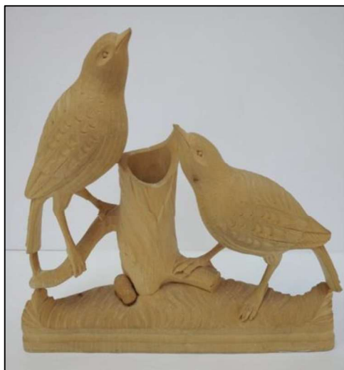
Fig. 2. Kuz'min N.N., two-figure volumetric sculpture "Warbler"

In the next chapter entitled "Creating a volumetric figure of an animal" [2] (Fig. 3 88 ), the process of sculpting a bear is discussed. The author notes that conveying the plasticity of forms and movements of various animals varies greatly, which should be taken into account when creating such a sculpture.