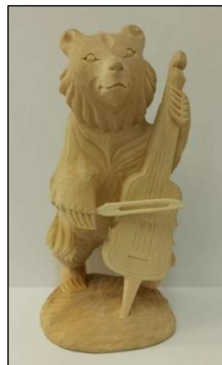
Fig. 3. Gorinov A.A., volumetric animal figure "Bear with basket"

Bogorodskoye institute for artistic wood carving