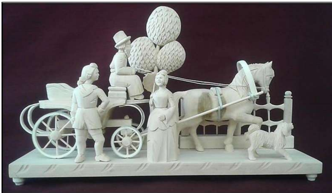
Fig. 6. N.A. Mal'tsyn. Sculptural composition "Walks along Tverskaya street". Bogorodskoye institute for artistic wood carving

V.F. Vaisero, in all his published textbooks, advises students and wood carvers independently learning the techniques of Bogorodskoye woodcarving to study the history of this type of folk craft, copy the best samples created over many generations of carvers, in order to form traditional methods of Bogorodskoye woodcarving and improve practical skills.