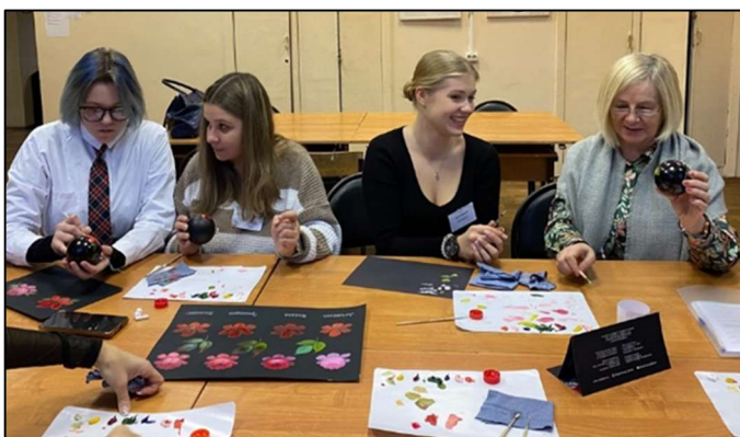
Fig. 7. Master class "Depicting Flowers Using the Multi-Layer Technique of Zhostovo Decorative Painting." 2024