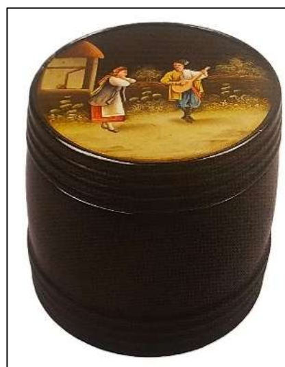
Fig. 1. Barrel "Meeting." 1882-1888. Workshop of O.V. Vishnyakov and Sons

Initially, trays were made from papier-mâché, along with boxes, snuffboxes, match holders, and caskets (Fig. 1). By the mid-19th century, tin trays began to replace papier-mâché products due to their simpler manufacturing process. Over time, "the