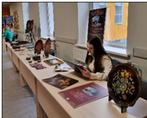
Fig. 6. Fair of Educational Institutions. "GIA. Awareness. Career Guidance." Mytischki City, 2024

The team of the Fedoskino Institute of Lacquer Miniature Painting compiled and published a catalog titled "Traditional Artistic Crafts of the Moscow Region," which brought together three types of traditional applied arts: Zhostovo decorative painting, Fedoskino lacquer miniature painting and Bogorodskoye woodcarving [10]. Many works from the collections of the Fedoskino Institute of Lacquer Miniature Painting and the Bogorodsky Institute of Wood Carving, featured in the catalog, were published for the first time.