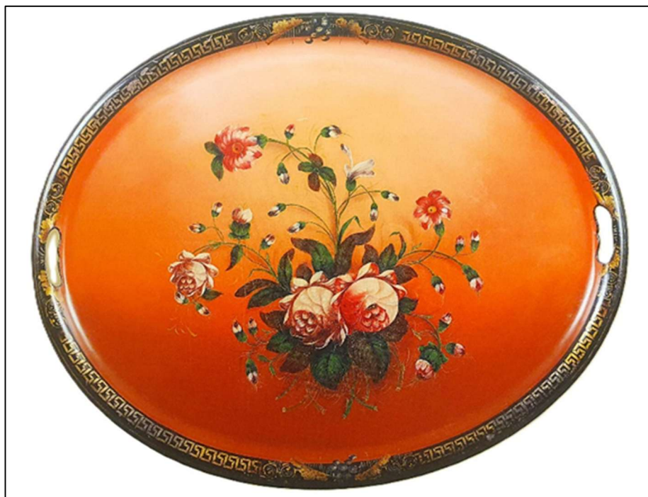
Fig. 2. Tray "Scattered Bouquet." 1880. Workshop of O.F. Vishnyakov and Sons

Over time, the main motifs of Zhostovo painting have been developed and perfected — floral bouquets combining large and small flowers, fruits and berries, executed on trays of various shapes and sizes. A vast collection of painting elements and ornaments has been accumulated: grass, loops, clouds, sails, hooks, braids, etc. (Fig. 2).