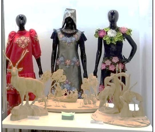
Fig. 3. Graduation projects of students from the Bogorodsky Institute of Wood Carving. 2025