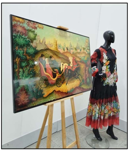
Fig. 6. Exposition of the exhibition "Splendor of Russia's Artistic Heritage" at the Gostiny Dvor exhibition complex in Moscow. 2025

Visitors to the "Unique Russia" exhibition forum highly praised the quality of the works created by students of the Russian University of traditional art craftsand its branches under the guidance of teachers—unique artists skilled in creating masterpieces in various forms of traditional applied arts. They expressed interest in the technological aspects of creating different pieces of traditional applied art showcased at the exhibition, as well as the possibility of collaborating with graduates of the Russian University of traditional art crafts.