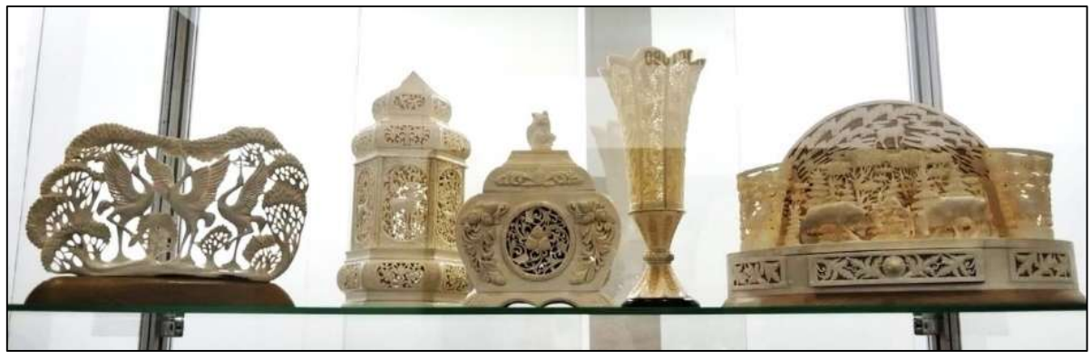
Fig. 4. Graduation projects of students from the bone-carving workshop of the Russian University of traditional art crafts. 2025

As part of the exhibition, thematic events, lectures, and presentations by exhibitors, master classes for visitors, performances by vocal and dance groups, fashion shows, excursions, and other cultural events were organized.