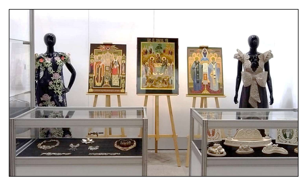
Fig. 1. Exposition of the exhibition "Splendor of Russia's Artistic Heritage" at the Gostiny Dvor exhibition complex in Moscow. 2025

The Russian University of traditional art craftsbecame the only educational institution in Russia to participate in this exhibition, which was held at a modern exhibition venue in the historical center of the capital (Fig. 1^{10} ).