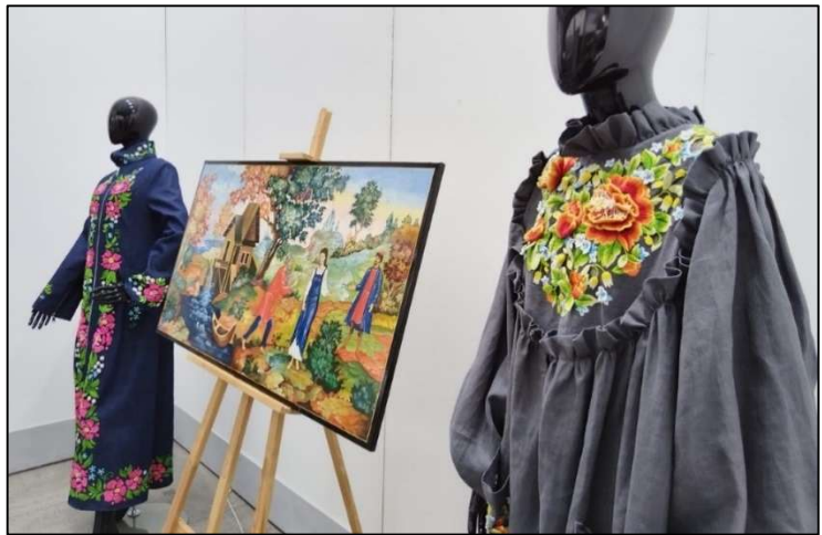
Fig. 5. Exposition of the exhibition "Splendor of Russia's Artistic Heritage" at the Gostiny Dvor exhibition complex in Moscow. 2025