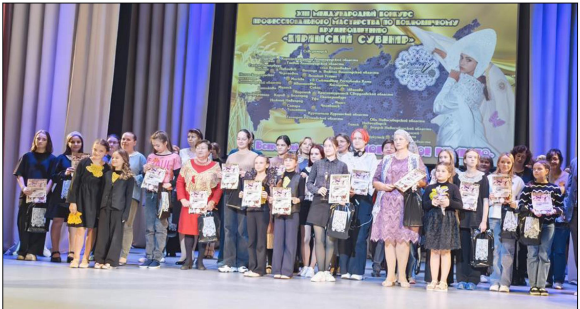
Fig. 8. Participants of the on-site stage of the “Lace Souvenir” contest