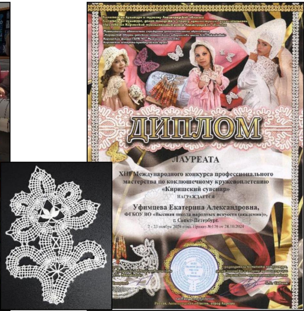
Fig. 10. Diploma of the laureate of the “Kirishi Souvenir” contest awarded to K. Ufimtseva