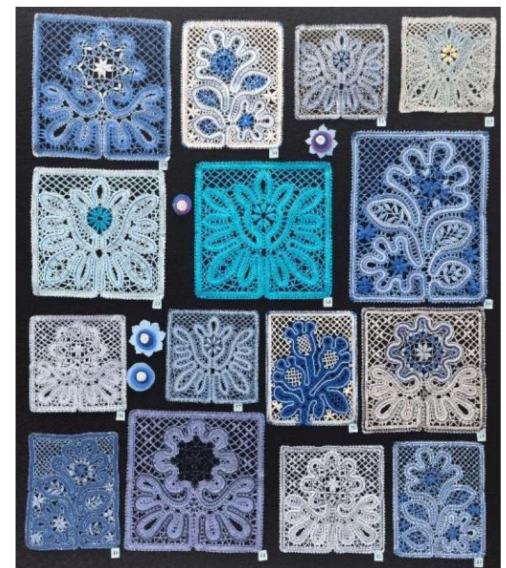
Fig. 4. Laceworks from the contest on the theme “Blue Flowers of Russia”