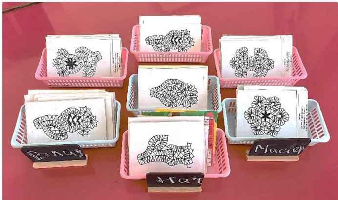
Fig. 3. Patterns for souvenirs on the theme “Flowers”