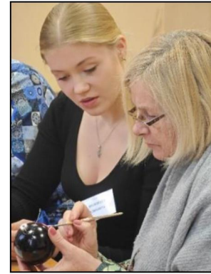
Figure 4. Master class "Depicting Flowers in the multilayer technique of Zhostovo decorative painting"