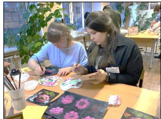
Figure 6. Master class "Depicting a Flower in the 'Moscow Letter' decorative painting technique"