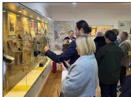
Figure 11. Excursion to the Museum of folk art crafts "Lukutin Estate"