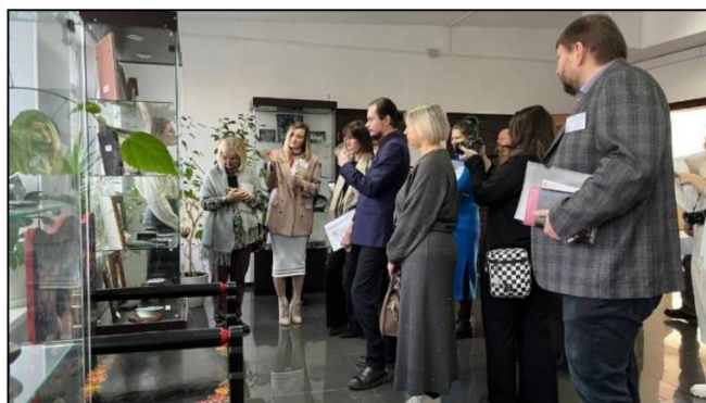
Figure 10. Tour of the museum-exhibition space "Lukutin Traditions". Fedoskino Institute of lacquer miniature painting

During the forum, participants had the opportunity to explore exhibitions featuring works by students and teachers from the Fedoskino Institute of lacquer miniature painting: "Flower Symphony" (Zhostovo decorative painting); "Royal Figures," "Winter Fun," "Magical World of Fairytales," "Lukutin traditions" (Fedoskino lacquer miniature painting); "Beauty of Rostov finift" (artistic enamel painting); "Unintentional Strokes" (academic drawing); "Life in Oil" (academic oil painting); "My Soul Lives Here" (paintings by Honored artist of Russia, N.G. Marchukov); "Teachers and Students" (paintings and graphic works by teachers from the Fedoskino Institute of lacquer miniature painting); Mstyora Institute of lacquer miniature painting named after F.A. Modorov – Mstyora embroidery in the "white satin-stitch" technique; Bogorodsky Institute of wood carving "Golden hands"; and the Institute of traditional applied arts "Beauty born of tradition."