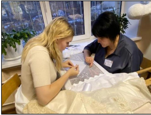
Figure 3. Master class on making "sewing" in the Ivanovo stitching technique.