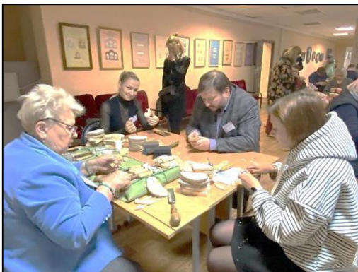
Figure 5. Master class on creating an owl toy with movement using the Bogorodskoye woodcarving technique "Gaze of the Night Guardian"