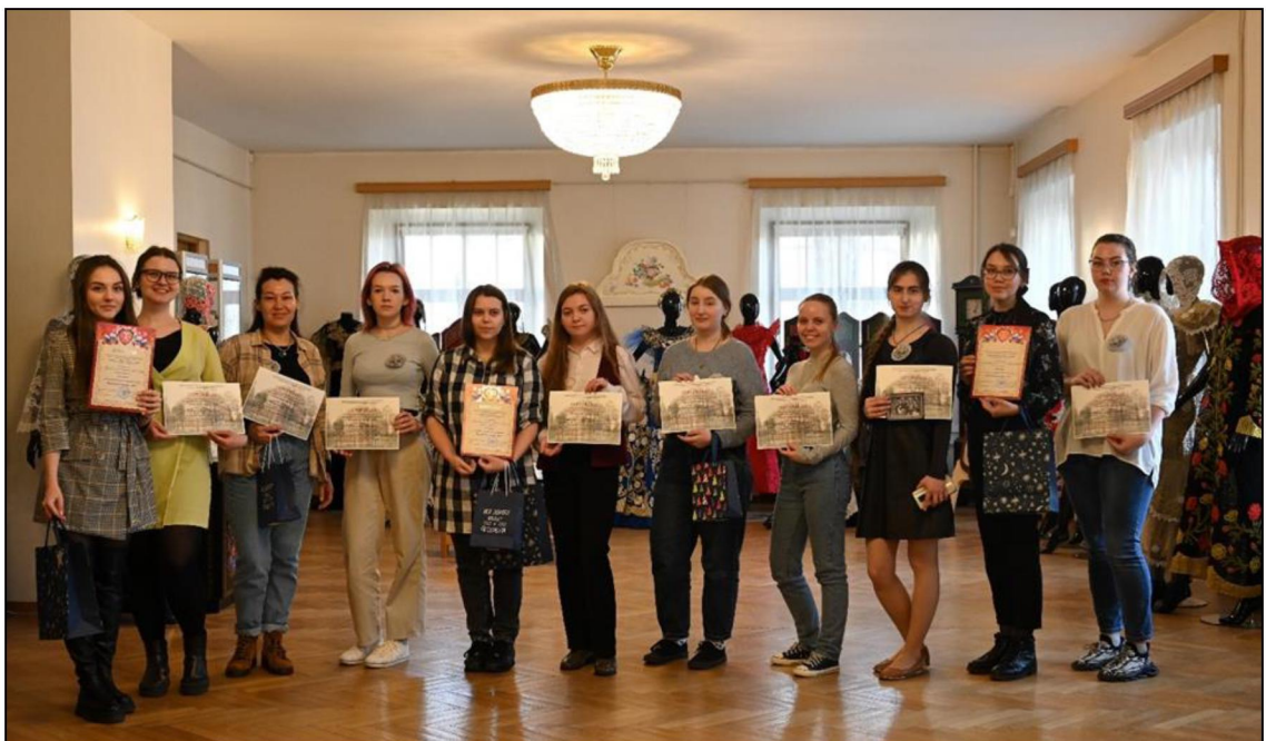
Fig. 11. Participants of the competition at the award ceremony