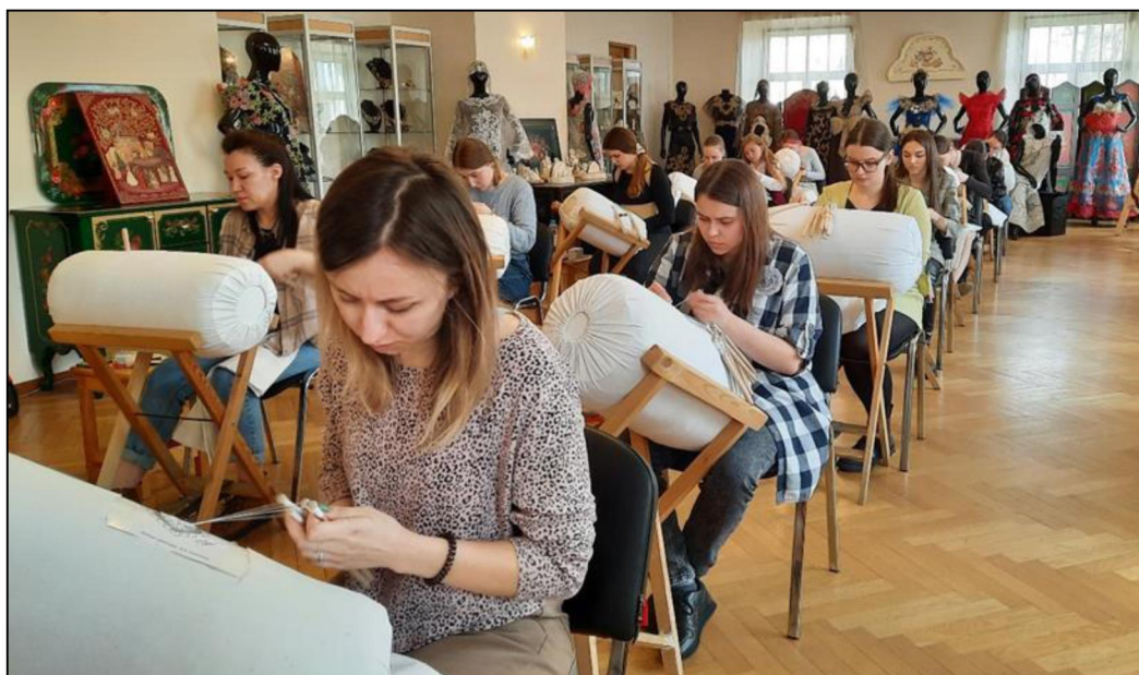
Fig. 2. Participants of the competition at work

The Lace Souvenir Competition is a professional competition consisting of 20 questions on theory and professional skills related to the execution of a small product. The contest time is 4 hours.