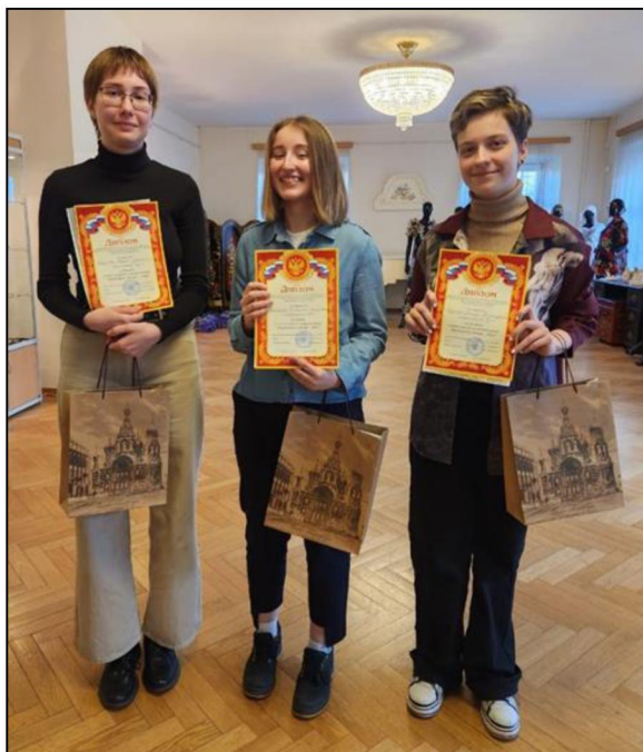
Fig. 7. Winners of the Lace Souvenir 2024 contest