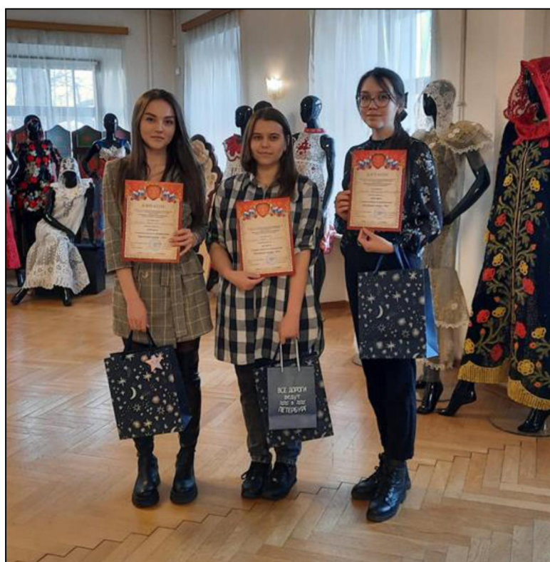
Fig. 5. Winners of the Lace Souvenir 2022 contest

Any professional competition reveals the strengths and weaknesses of the contestants. You can be confident in yourself, answer all the questions perfectly but you can't cope with the excitement, you can't complete the competition task in the allotted time. But this should not alarm and scare away. On the contrary it is necessary to try your hand and determine your capabilities.