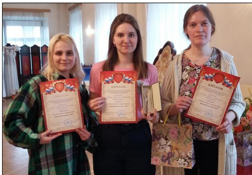
Fig. 3. Winners of the Lace Souvenir 2019 contest

The Lace Souvenir Competition is a professional competition consisting of 20 questions on theory and professional skills related to the execution of a small product. The contest time is 4 hours.