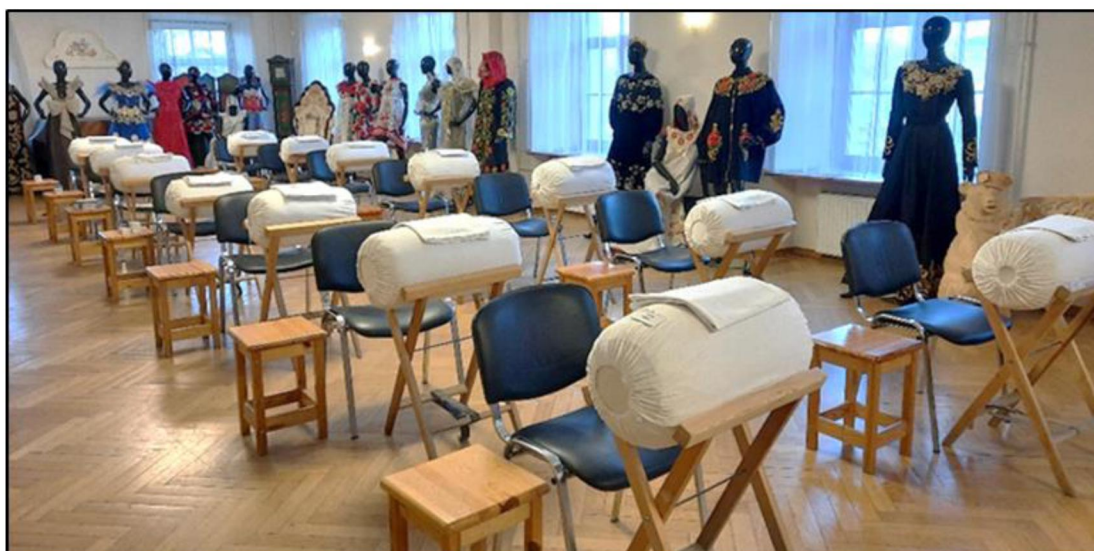
Fig. 1. A workspace for performing a practical task at the Lace Souvenir competition. Higher school of folk arts (academy) 13

The competition at the Higher School of Folk Arts (Academy) "Lace Souvenir" started in 2016. The competition is held among young specialists in the field of artistic lace weaving at the head university and the Ryazan branch of the Higher school of folk arts. The competition is an analogue of the All-Russian lace-making competition "Silver Bobbin" held several years ago in Vologda on the basis of the Governor's College of Folk Crafts.