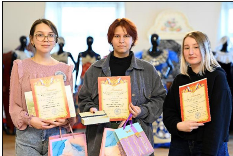
Fig. 6. Winners of the "Lace Souvenir – 2023" contest

The main prize of the Lace Souvenir competition is a silver bobbin with gilding (fig. 8) made by special order of the Higher school of folk arts by the 'Severnaya Chern' enterprise (Veliky Ustyug).