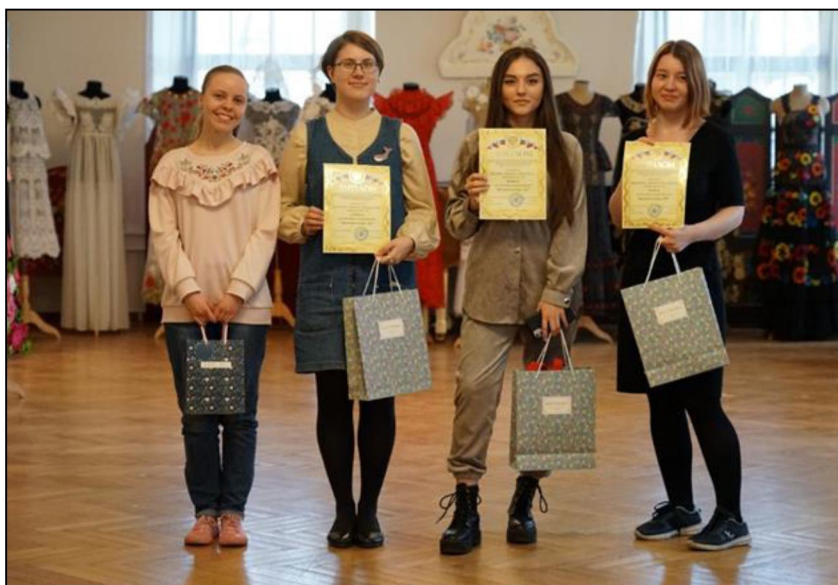
Fig. 4. Winners of the Lace Souvenir 2021 contest