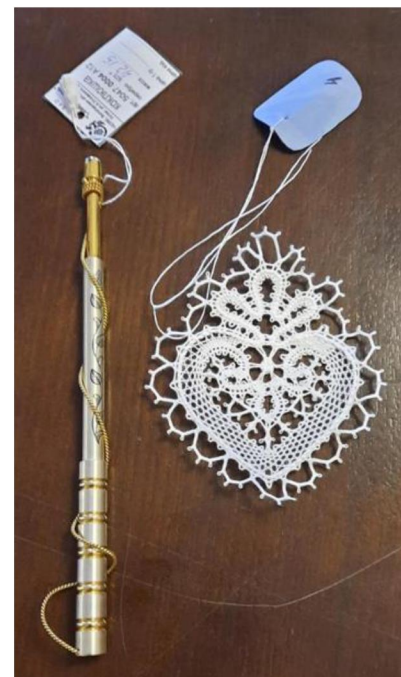
Fig. 8. The main prize of the competition is a silver bobbin with gilding and a completed practical task