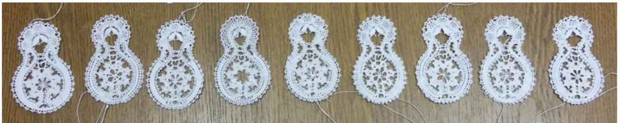
Fig. 10. Souvenirs made by the participants of the competition in 2019