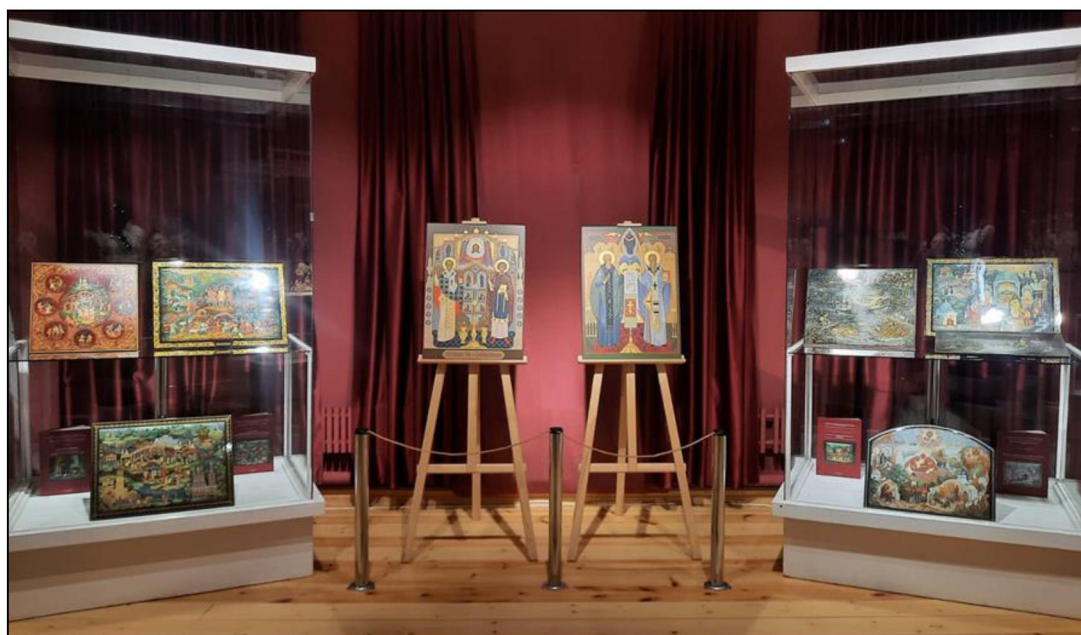
Fig. 2. The central part of the exposition of the exhibition "The splendor of the artistic heritage of Russia" in Arkhangelsk

talented teachers and artists in the field of bone-cutting art of the Higher school of folk arts (academy). Their works are also presented at the exhibition "The Splendor of Russia's Artistic Heritage".