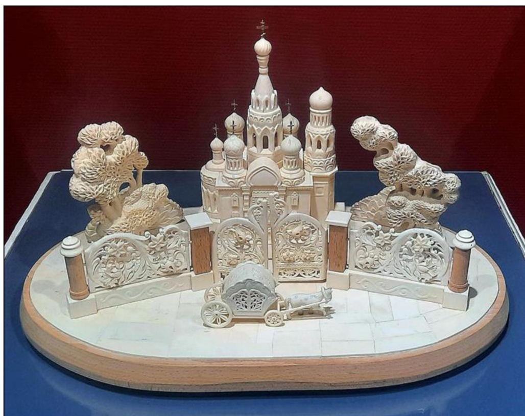
Fig. 3. Piskunova A. Sculptural composition "At the Mikhailovsky Garden." Final qualifying work. 2022 Head V.N. Kolobov