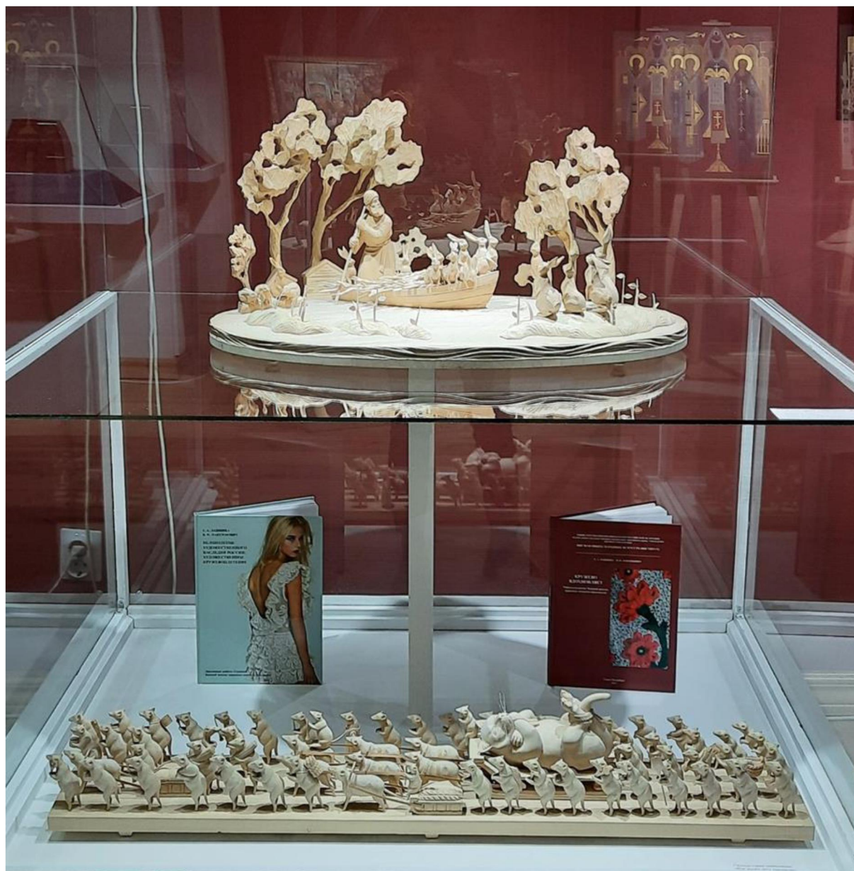
Fig. 6. Final qualifying works: sculptural compositions "Grandfather Mazai and the hares" and "How the mice buried the cat." Bogorodsky artistic wood carving

the most difficult because the image of a human or animal figure requires spatial thinking from the artist, the ability to feel proportions and perspective.