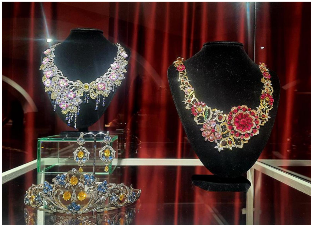
Fig. 8. Final qualifying works of students of the Higher school of folk arts: jewelry necklaces, earrings and tiara

The results of the exhibition indicate a large attendance, excellent feedback from visitors (fig. 9), master classes for children organized by the museum staff in the exhibition space, creative meetings and the annual mass event "Night of