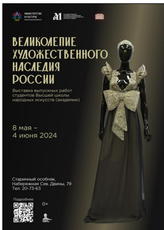
Fig. 1. Poster of the exhibition "The splendor of Russia's artistic heritage"

The old mansion on the Embankment of the Northern Dvina in Arkhangelsk is an architectural monument that was built in 1786. There is an exhibition hall with enfilades on the ground floor of the house which are beautiful in architectural design. Arched openings divide the exhibition space into three parts. Thanks to this layout the works presented by the Higher school of folk arts were successfully exhibited and divided into areas of traditional applied art.