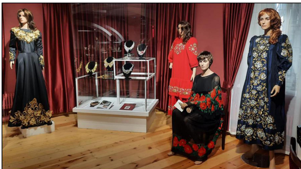
Fig. 4. Final qualifying works of students of the Higher school of folk arts (academy) dresses with artistic embroidery and jewelry necklaces

The works of jewelry art perfectly fit into the exhibition space; professional lighting favorably emphasized the beauty of the jewelry (fig. 5, 8).