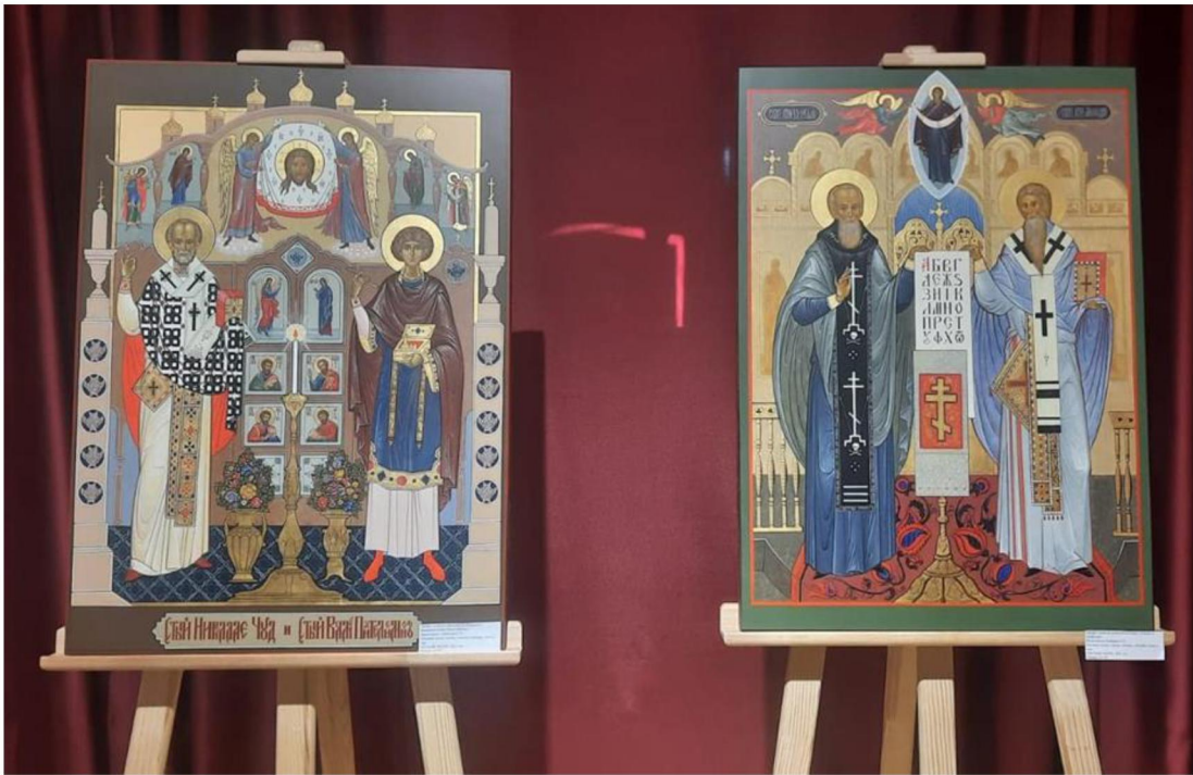
Fig. 7. Church historical painting: icons. Final qualifying works of students of the Moscow institute of lacquer miniature painting named after F.A. Modorov – branch of the Higher school of folk arts (academy)